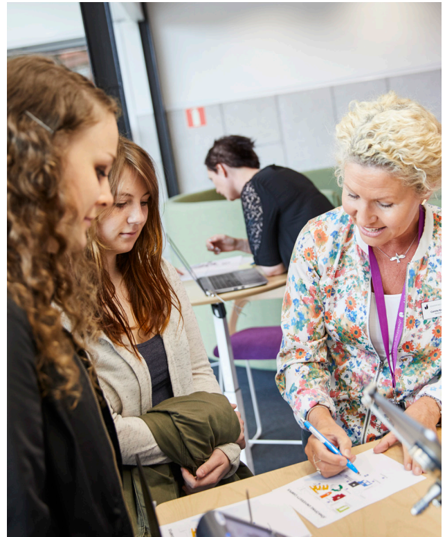
JÖNKÖPING UNIVERSITY February 2019